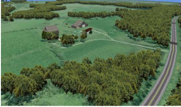
Figure 1. Forest stands represented by a randomly scattered, single, 3-D tree model. Notice the unnatural regular appearance, consistent height, and apparent “regimentation” of each forest stand.

In conjunction with other ancillary information about regional plant communities, it is possible to derive more detailed conclusions about the makeup of unique forest stands. For example, within the Southwest United States there exist several well-defined warm desert plant communities (Table 2). Each of these is further divided into several series or subdivisions.