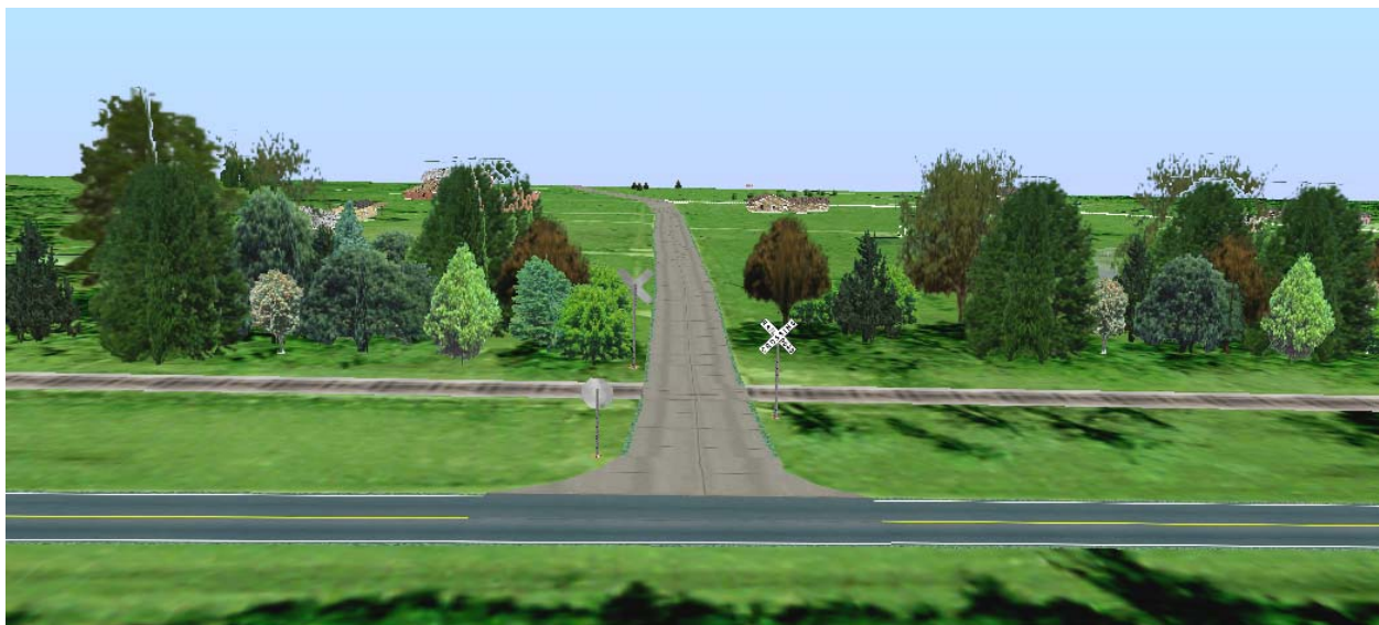
Figure 4. An example of the diversity of tree species possible in future virtual forest stands.

existing texture. There are a few other manual tasks like renaming the top-level group, that will also have to be performed. However these are trivial compared to manual recreating all polygons for each new tree model.