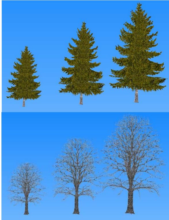
Figure 3. Representative examples of 3-D models generated during this research effort.

In addition, to allow the display of this added vegetation detail, a preliminary set of specie-specific